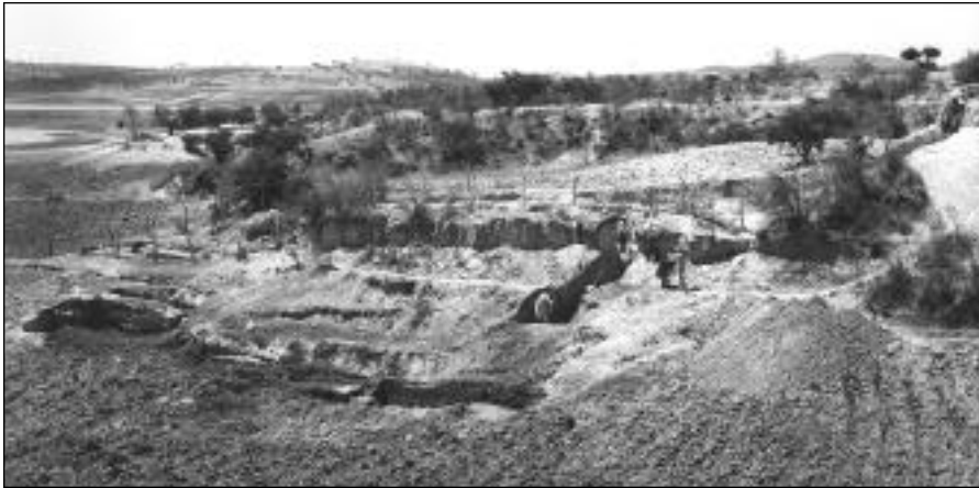
Overview of the Hueyatlaco site in 1973 during excavation to expose the sedimentary layers and to collect samples for zircon fission-track dating. The artifact-bearing beds appear at lower left; the volcanic ash and pumice layers occur in the overlying (younger) sediment cap, visible at middle and upper right.

By 1980 my career as a research geologist was suffering. My professional correspondence, both